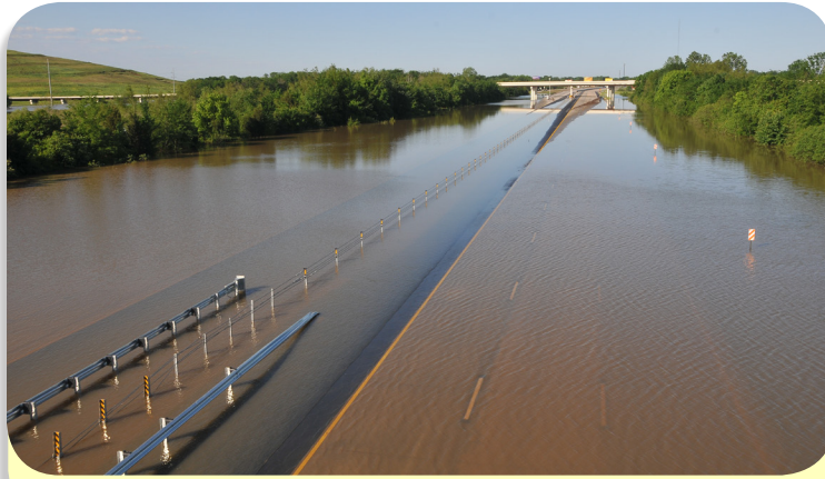
Highway 67/167 covered by water just south of Jacksonville.

The closed highways around the state resulted in a high volume of telephone inquiries to the Department. Staff at