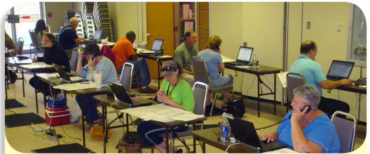
Volunteers work the telephones in the Central Office auditorium.

Though Interstate 40 and Highway 67/167 opened again in the week that followed, a long list of flooded highways and a high volume of telephone calls kept AHTD staff busy for several weeks after the storms passed through.